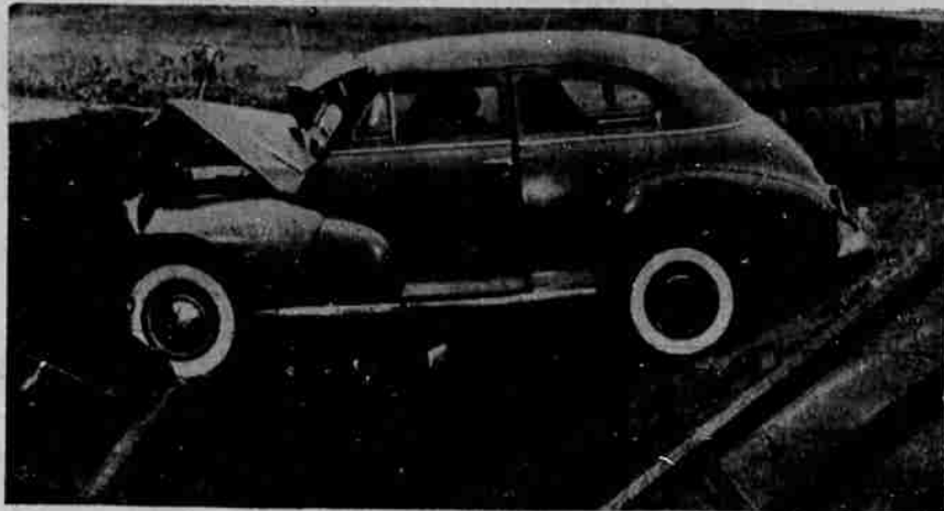
END OF THE LINE —The flight of two desperados, fleeing with a hostage, came to an abrupt halt near Washington, Kan., where their speeding vehicle crashed into a washed-out bridge (above) ending a wild, 72-hour flight across five states. The two gunmen along with a third, who gave himself up earlier, allegedly killed a Minneapolis policeman during an attempted robbery.

DOUGLAS COUNTY Farm Bureau Co-Operative Exchange ROSEBURG, OREGON Phone 98 Located—W. Washington St. and S P. R. Tracks