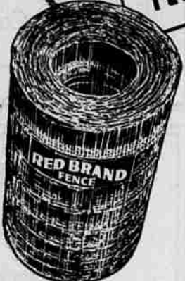
The fence that lasts years longer.