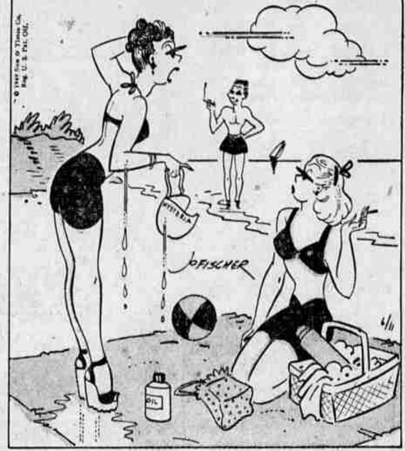
It's a good thing I know how to swim, Deleria. The way that guy was teaching me, I almost drowned. By Chic Young

RADIO SERVICING Hansen's Radio Service, Sutherlin. Radio Doctors, Phone 491-J.