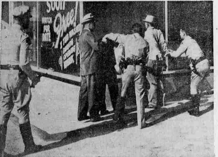
GUNMAN CAPTURED—Officer (left) covers holdup suspects while special guards from two Linwood, Cal., stores slip handcuffs onto two gunmen who were flushed from a supermarket by the store's guards. The bandits were captured after a blazing gun battle during an attempted robbery of the store.