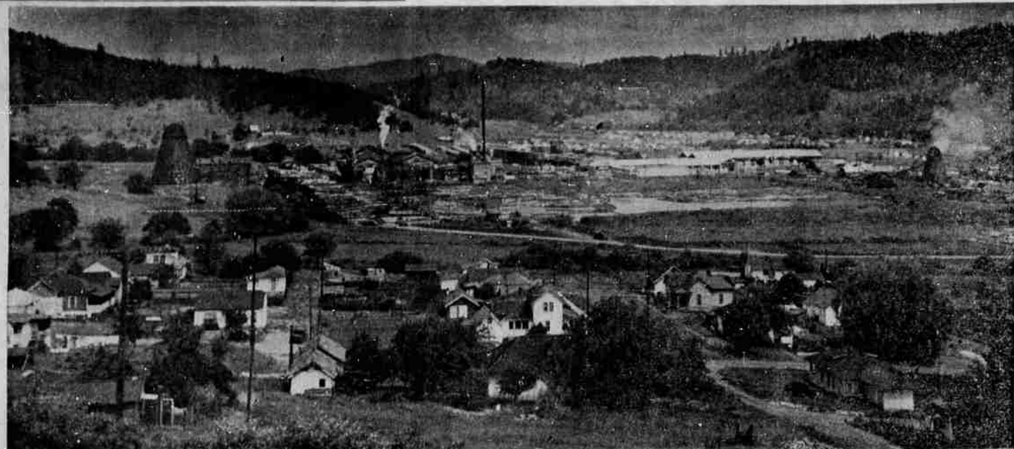
EASTWARD VIEW —Pictured above are the valley and hills east of Roseburg, taken from the hill above Benson School. One of the principal landmarks in the valley is the large, sprawling Youngs Bay Lumber Co. mill, seen in the distance. To the right, near the North Umpqua Highway, is the smaller Joelsen's Mill. In the foreground, on the hillside slope are homes of Roseburg citizens. Lower picture shows a closer view of the Joelsen Mill.