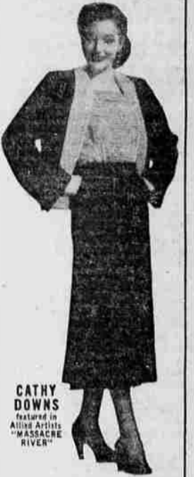
CATHY DOWNS featured in Allied Artists "MASSACRE RIVER"

For the ultra smart . . . a three piece Tuxedo ensemble, styled by Logan knit, with striped tuck-in blouse to match the Tuxedo coat and featuring the new slender silhouette. It is also ultra smart to choose Hollywood Bread for adding luxurious flavor to your low-calorie diets. Hollywood Bread is the perfect fulfillment of that desire for the very best. No shortening and No Fats added. Baked for you exclusively by WILLIAMS BAKERY