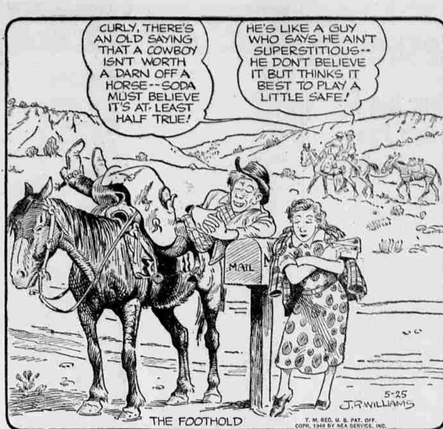
OUT OUR WAY