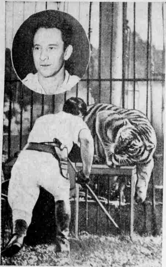
CLYDE BEATTY The Greatest Wild Animal Trainer in World History

If ever you have wondered how a man has the nerve to step into a cage completely filled with 40 of the most treacherous and ferocious man-eating beasts that breathe—your chance to see just that, is coming. For Clyde Beatty, the greatest and most fearless wild animal trainer ever known, will be the top-flight attraction with the huge Clyde Beatty Circus, coming to Roseburg, Saturday, June 4, for afternoon and night performances at the circus grounds west on the Garden Valley Road, and his display, conceded the most breath-taking and daring feat ever offered circus fans, will be enacted before your eyes. Armed only with a whip and a common folding chair as a protection against the snarling creatures, he will put the entire group