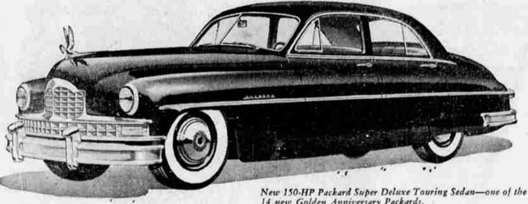
New 150-HP Packard Super Deluxe Touring Sedan—one of the 14 new Golden Anniversary Packards.

Thanks, Roseburg, for the way you're celebrating our Golden Anniversary!