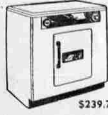
Clothes Dryer. Electric, fully automatic. $239.75

Ask for a demonstration of these FRIGIDAIRE Appliances NOW!