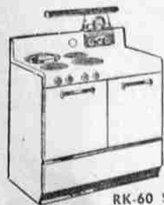
De Luxe Electric Range. Fully automatic. A nationwide favorite. RK-60 $289.75

keeping fresh or frozen meats, more space for keeping leafy vegetables and fruits dewy fresh, more usable shelf space for other foods. In fact, more of everything you want—inside and out!