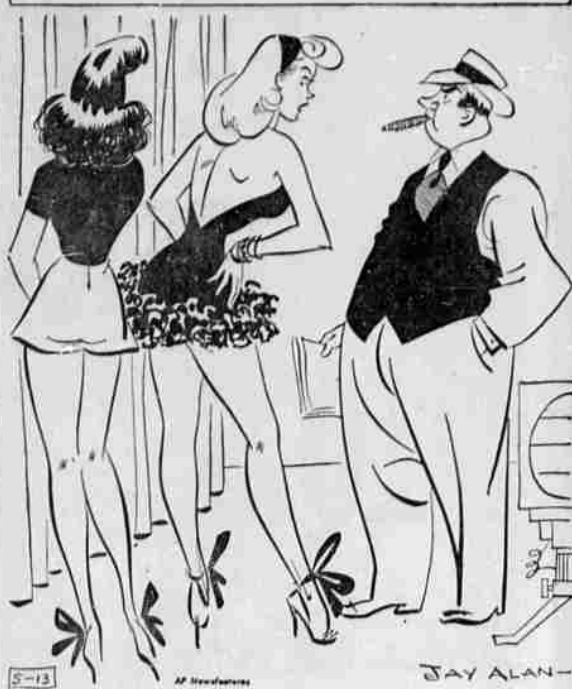
THE AUDIENCE WILL HAVE TO ACCEPT ME AT FACE VALUE. MY MOTHER WON'T LET ME WEAR THIS COSTUME!