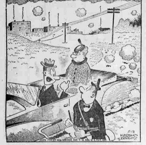
"Give her the ticket—she's doing the driving!"