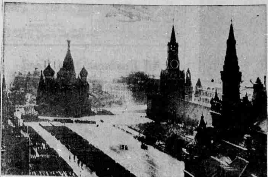
According to caption furnished by a Soviet agency, this radiophoto is a general view of Red Square in Moscow during the time of the Soviet Army's part of the May Day parade. Lenin Mausoleum from which Stalin reviewed the parade is partly visible behind lower left tower in the right foreground.