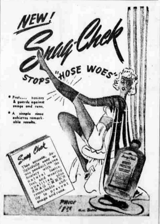
Roseburg Pharmacy Phone 7 241 N. Jackson