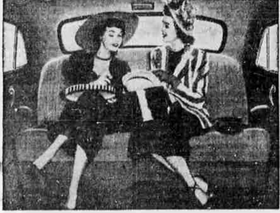
WIDER on the inside ... NARROWER outside! There's extra value in the spread-out elbow room of the wide, wide seats. Yet the new Dodge is smaller on the outside . . . easy to park, easy to garage,