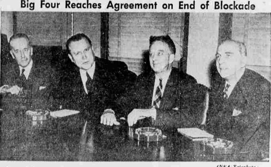
Representatives of the Big Four (above) wind up their discussions in New York for the lifting of the Berlin blockade. May 12 was set as the date for ending the blockade and May 23 as the date for the lifting of the Berlin blockade. From left to right: Sir Alexander Cadogan, Great Britain; Jacob Malik, Soviet Russia; Dr. Philip C. Jessup, U. S., and Jean Chauvel, France.