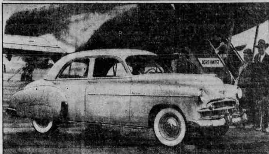
Progressive streamlining of the 1949 Chevrolet is in line. Notable in the roomier, lower cars is a balance of emphasis in this view of the Styleline De Luxe four-door sedan against a new Martin 202 passenger air- as well as smart appearance.