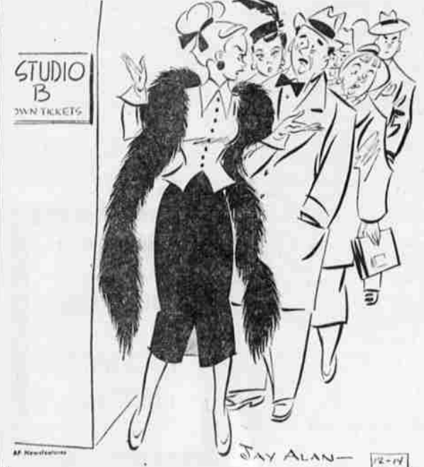
THIS PROGRAM'S NO GOOD, THEY DON'T GIVE AWAY ANY RADIO, DEEP FREEZE UNITS OR NECKLACES, JUST MONEY.!!

Trademark Registered U. S. Patent Office