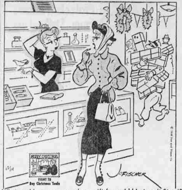
What would you recommend as a gift for a girl I just can't stand?