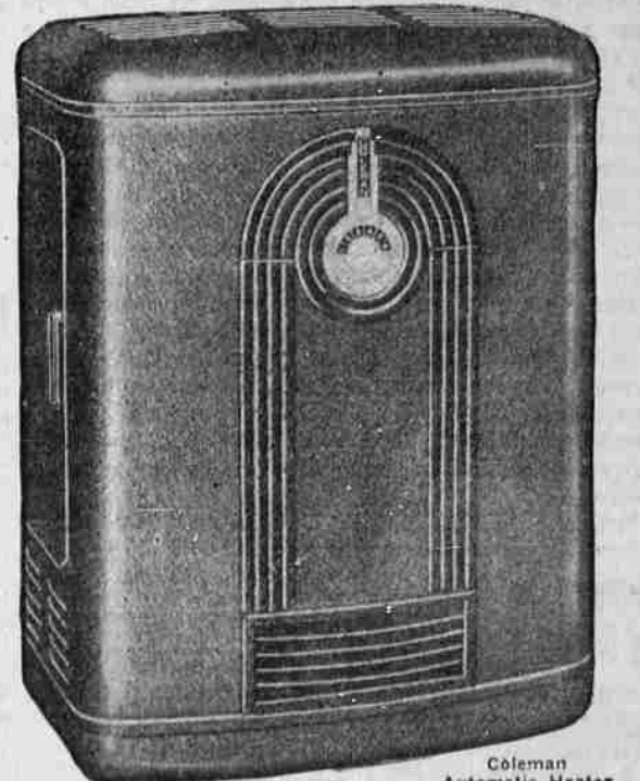
Coleman Automatic Heater

25.00 off on the regular price of this Coleman Circulating Oil Heater when you bring any old heater or stove in exchange. Reg. price 129.85 Less 25.00 Total price 104.85