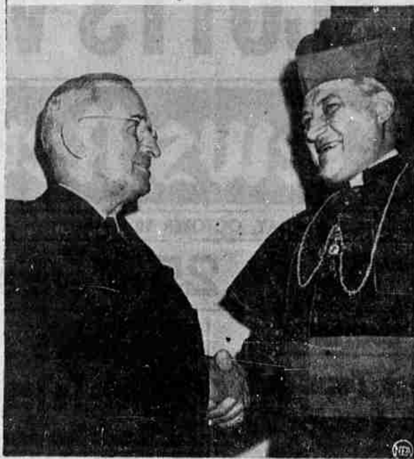
President Truman is greeted by Archbishop Richard J. Cushing on his first official campaign call at Boston, Mass. Archbishop Cushing may soon be named by Pope Pius to the College of Cardinals.