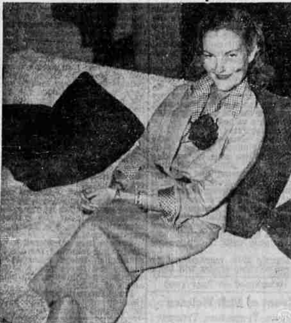
Doris Duke, tobacco heiress, relaxes at her Reno, Nev., home after being granted a surprise divorce from her second husband, Dominican Republic diplomat, Porfirio Rubirosa. Miss Duke, whose father left her a $30,000,000 estate, said she and Rubirosa "just couldn't get along."