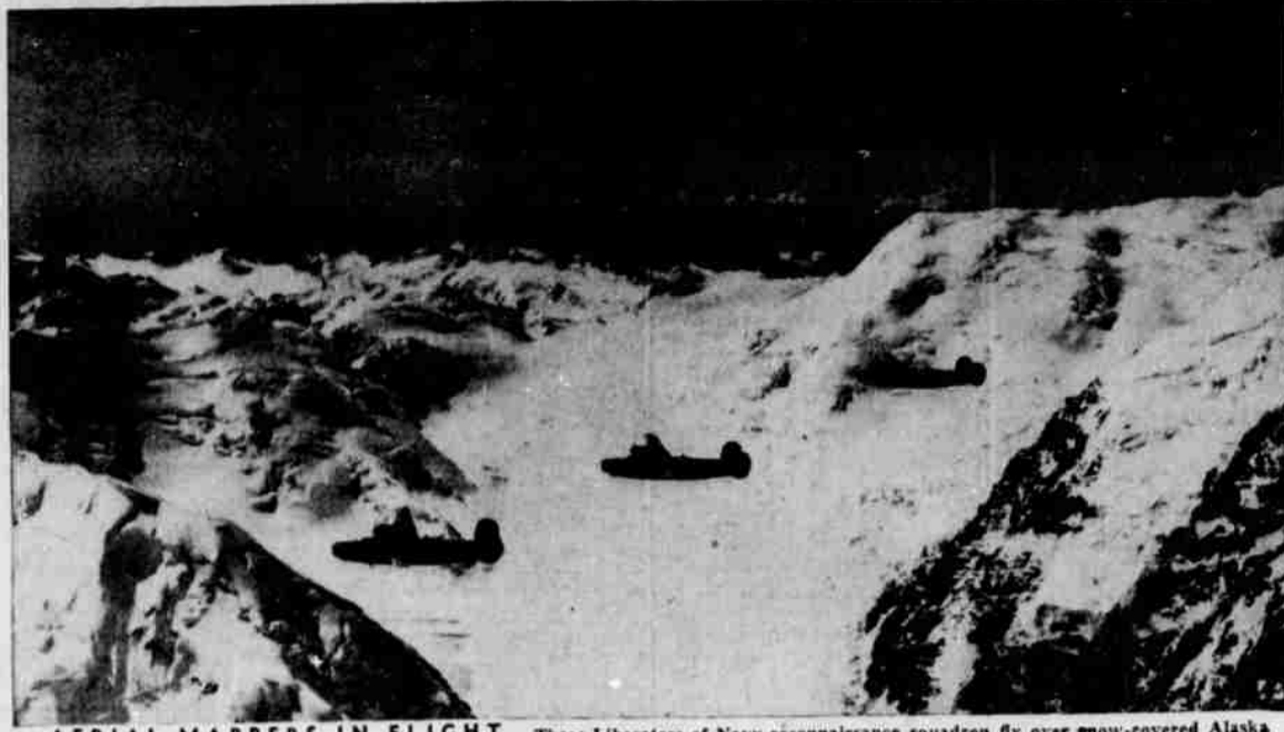
AERIAL MAPPERS IN FLIGHT —Three Liberators of Navy reconnaissance squadron fly over snow-covered Alaska in the vicinity of Mt. Hayes on an aerial mapping mission. Hundreds of unnamed lakes and streams were charted.

North and South America. "Nowadays," Mr. Hoover said, "Communist fifth columns in every country systematically and incessantly, by conspiracy and by subsidized press and radio, excite fear and ill will against us." "Nor have we been without fault," he added. "In two periods we have interfered with the internal affairs in these independent sovereignties. "Thirty years ago we undertook, in two countries, to restore order by the use of troops. Unfortunately, in the past five years some officials from our State Department have regrettably interfered in internal elections."