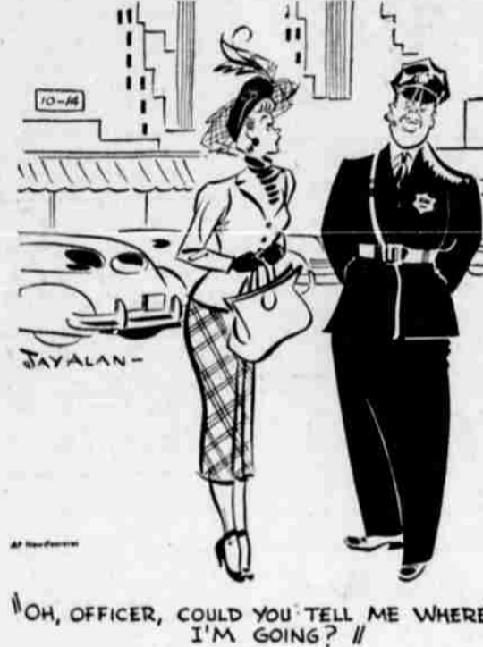
"OH, OFFICER, COULD YOU TELL ME WHERE I'M GOING?"