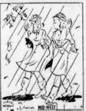
"There's something about all this rain that reminds me of that drip marin."

Richmaid Ice Cream Made Fresh Daily Phone 374-R 743-B, 812-11