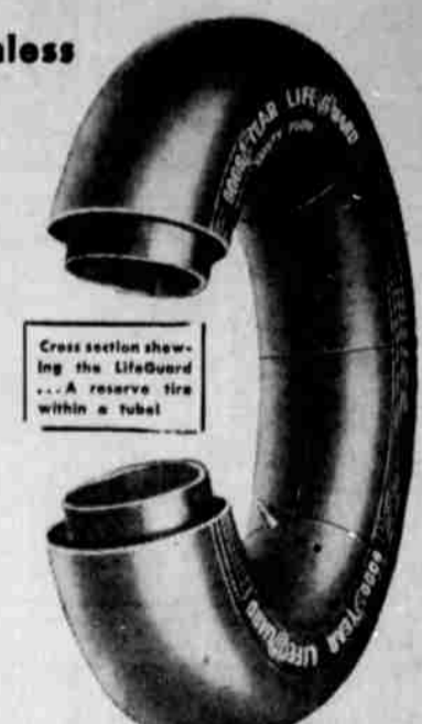
Cross section showing the LifeGuard... A reserve tire within a tube!

With a LifeGuard Safety Tube in your tire you have a 2 ply reserve tire built inside an extra sturdy tube... an inner air chamber that stays inflated long enough for you to brake and steer to a smooth, safe, gradual stop when a blowout occurs. Besides saving lives—LifeGuards also save tires. Stop in and let us explain all the advantages of Goodyear LifeGuard Safety Tubes.