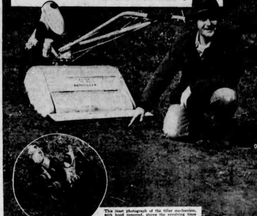
This inset photograph of the tiller mechanism, with hood removed, shows the revolving tines which break up and mix soil, fertilizer and organic matter to full tillage depth.