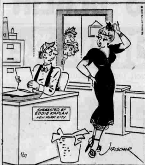
You're the only man around here who hasn't annoyed me and I want you to know I'm insulted!