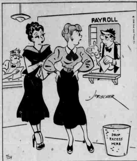
I didn't mind them firing me but when they take me off the payroll, that's going just a bit too far!