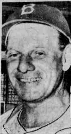
Dodger Manager Leo Durocher changed to Giant uniform in baseball's biggest shakeup of year.