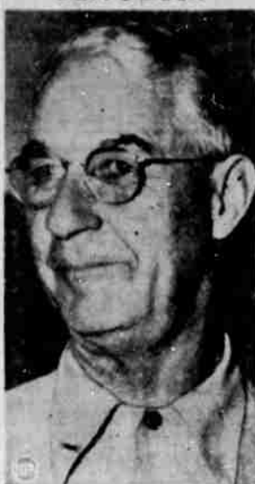
Last year's flag-winning manager, Burt Shotton, was called from retirement to pilot the Dodgers again.