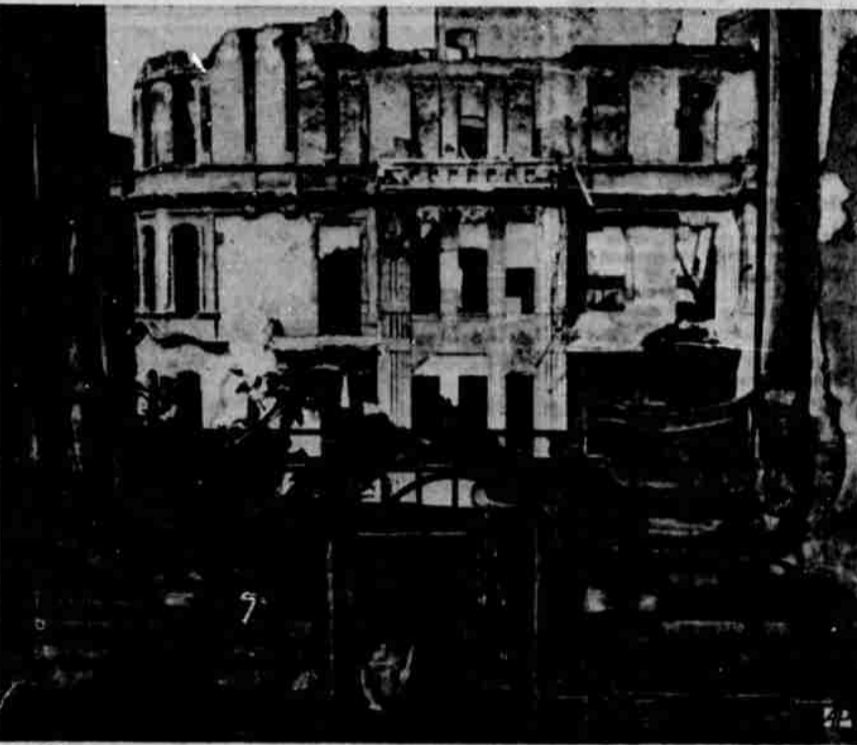
BERLIN RUBBLE GARDEN —A Berlin woman uses the balcony of a vacant flat on the first floor of a bombed out building to raise vegetables in pans and boxes.

MODERN FURNITURE COMPANY 222 W. Oak Phone 348