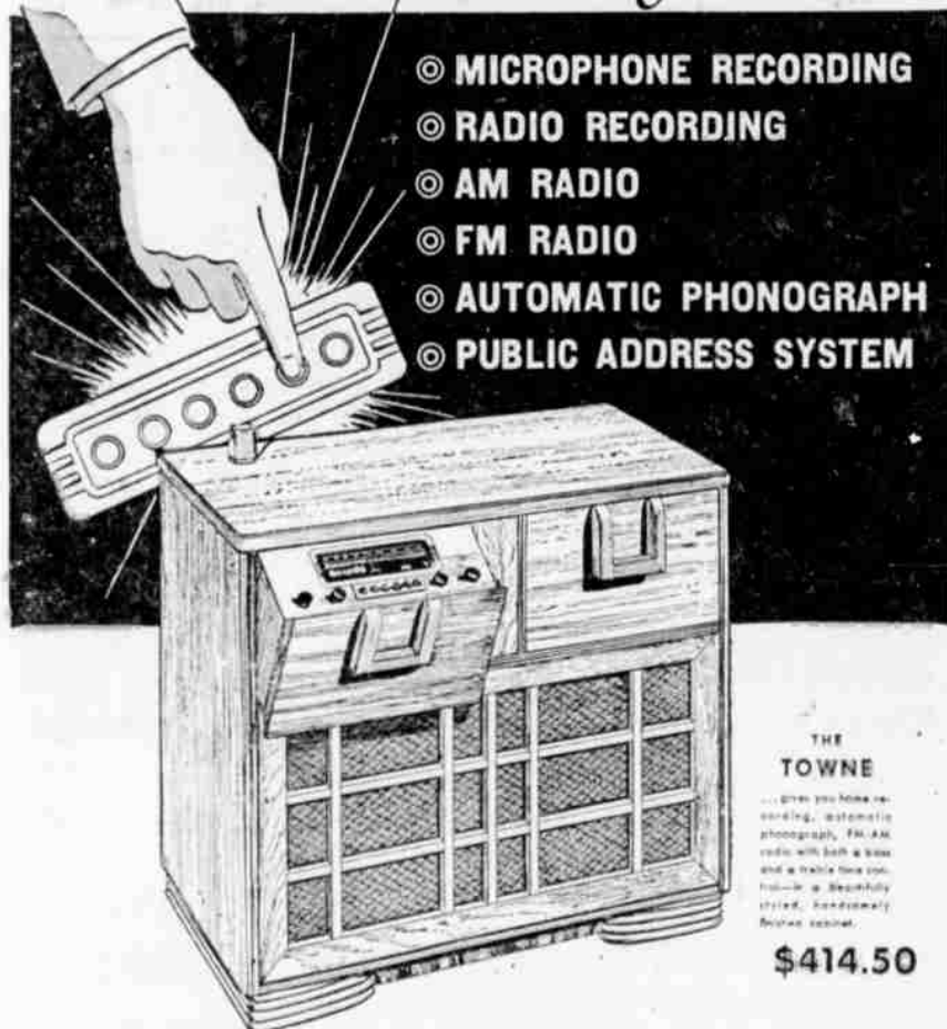
THE TOWNE ... give you Mike recording, automatic phonograph, FM AM radio with both a base and a table top set, include a beautifully styled, handomely finished cabinet.