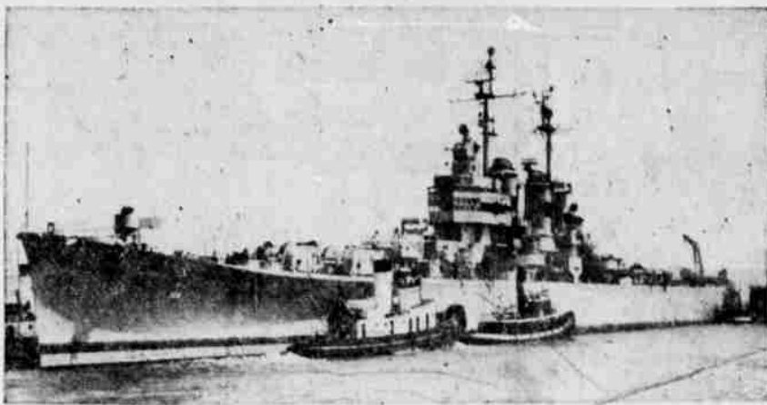
Incorporating lessons learned during World War II, the light cruiser USS Worcester, just completed in Camden, N. J., is the latest addition to the American fleet. The 17,000-ton ship, shown in the Delaware River, was named after the Massachusetts city which raised the $30,000,000 it cost. The Worcester, armed with six-inch guns, has a watertight hull. If hit below the water line, only the hold actually damaged would be flooded.