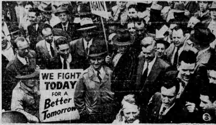
Henry A. Wallace (arrow), third party presidential candidate, is surrounded by pickets as he joined their line around the Dodge main plant at Detroit, Mich. Chrysler Corporation employees struck for higher wages.