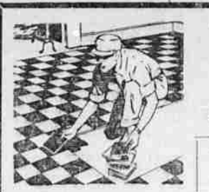
Floor Covering Wright Rubber Tile

The Mississippi River system of inland waterways has approximately 600 operators of boats and barges, ranging from single vessels to large fleets.