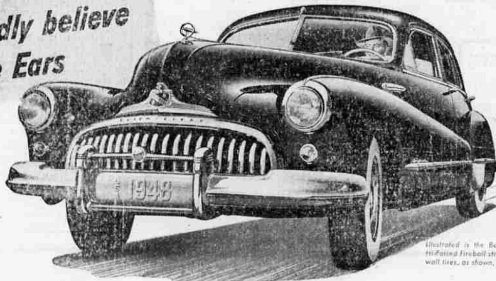
Illustrated is the Buick Super with 115 hp, Hi-Posed Fireball straight-eight, White sidewall tires, as shown, available at extra cost.

WE don't mind admitting we've been pretty proud of our big Fireball straight-eight engine.