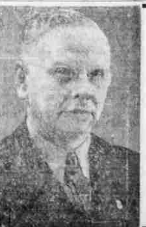
Earl Long, Governor of Louisiana.

The capital was in holiday attire for the ceremonies which climaxed an eight-year-old struggle by the brother of the late Sen. Huey Long to regain the state's highest office. Preparations were made for