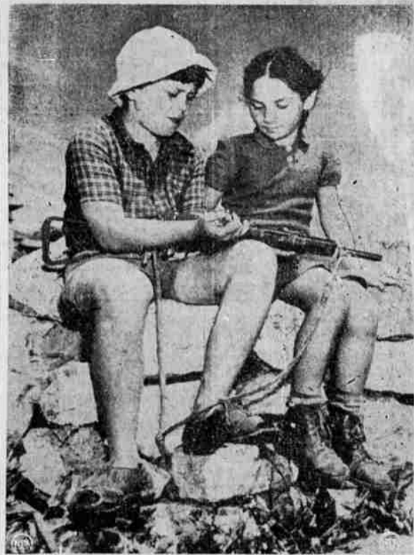
A 12-year-old Jewish boy teaches a girl of elementary school age the mechanics of operating a Sten gun. The lad is an expert with the weapon. Children living in the Jewish agricultural settlement of Nevat Yaakov, Palestine, learn defense measures against Arab attack in addition to the classical three R's of reading, writing and arithmetic.