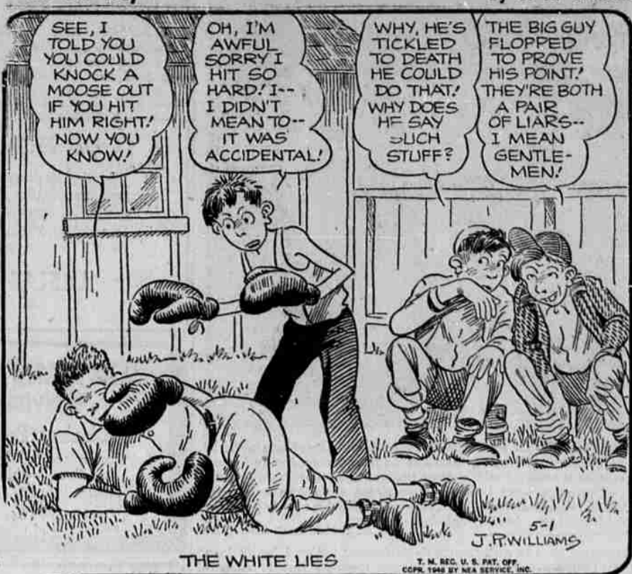
THE WHITE LIES