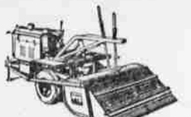
Motorized models (gas or diesel powered) are available in 4-ft. to 6-ft. tillage widths.

The best way to make sure of a good crop is to make GOOD SEEDBEDS. And the best way to do this is to use a farm-size SEAMAN ROTARY TILLER. It does these things: • pulverizes the soil thoroughly and uniformly; • mixes fertilizer and humus into the growing area of the seedbed where it does the most good; • helps to increase nitrogen supply through complete seedbed aeration; • hastens and promotes more complete germination of seed; helps to maintain higher seedbed temperatures; • doesn't leave any air pockets or hard plow soles to retard plant growth; • keeps moisture in the seedbed for a healthy stand; • helps to destroy many crop pests and certain varieties of fungus; • provides effective weed control when operated with hood open. ALL THIS . . . with one implement, supplied in a complete range of sizes from 3 ft. to 6 ft. tillage widths, power-take-off and motorized (gas or diesel) models. Write for full information . . . and see your local SEAMAN Dealer.