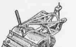
Power-take-off models are available in 36", 42", 48", 60" and 72" tillage widths. A top-rated two-pow tractor will handle the 36" tiller and a top-rated 3-pow tractor will handle a 42" Seaman Tiller.