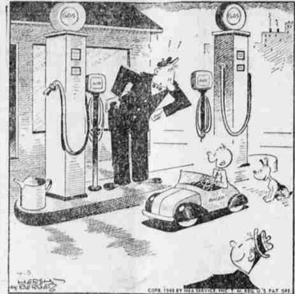
"No gas—just the trimmings, mister!"