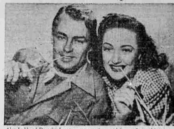
Alan Ladd and Dorothy Lamour are in the mood for work in this scene from "Wild Harvest," a Paramount picture with Robert Preston.