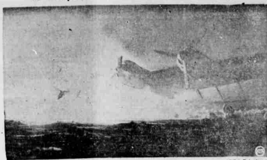
All 25 persons aboard this Eastern Airliner Constellation escaped death when the big plane skidded after landing, crashed on its nose and burst on an ice-glazed runway at a Boston, Mass., airport. Six passengers were hospitalized but all were expected to recover.