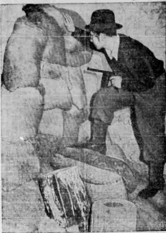
Wearing the side-curls of the orthodox Jews, a member of the Haganah, underground army, keeps watch at a sandbag barrier in the "No Man's Land" between Arab Jaffa and Jewish Tel Aviv in strife-torn Palestine.