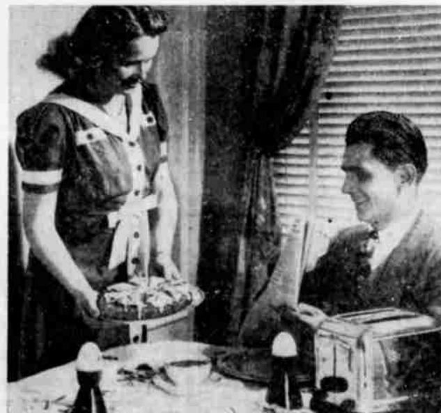
WEANING A HUSBAND away from his morning newspaper is no trick at all when you serve this fragrant, tender Martha Meade Breakfast Cake. Smart brides know they can't miss—because 117 Western women on the Martha Meade Home Staff regularly bake-check Drifted Snow Flour with Martha Meade recipes to assure your success.