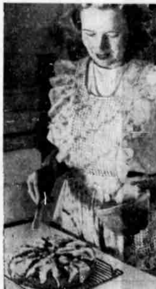
A LIGHT ICING puts the finishing touch on the Raised Breakfast Cake. Look for other Martha Meade recipes in every sack of Drifted Snow Flour.