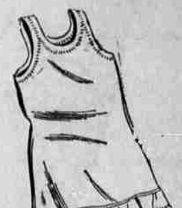
Fancy Rayon Slips For a Little Lass

Fine white cotton with built up shoulders and dainty hem ruffle. Hemstitched neck and armholes. 1-6. 41c