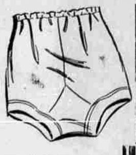
Lovely Cotton Panties For Girls 2-12

They're well tailored for better fit—have neat front and back action-pleats. Brown, navy, and gray. 4.69