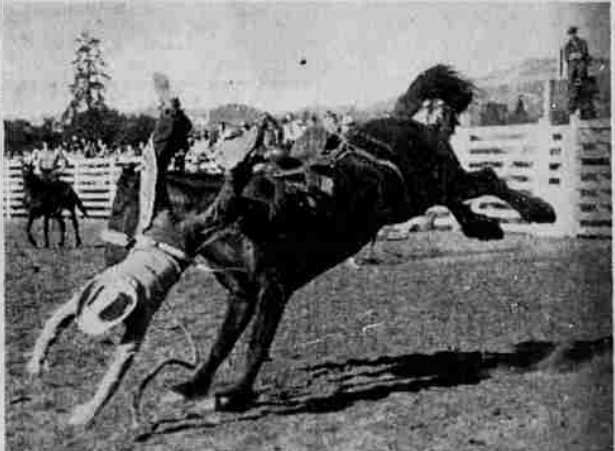
GREASED LIGHTNING is the best description for the speed of events connected with the Douglas County Sheriff's Posse Rodeo at the County Fair Grounds Saturday and Sunday, June 22 and 23. Bucking, calf roping, brama bull riding and other events demand speed and split-second timing.