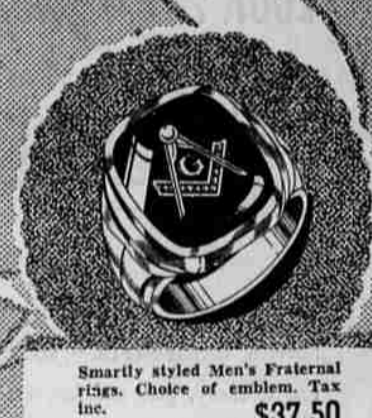
Smartly styled Men's Fraternal rings. Choice of emblem. Tax inc. $37.50