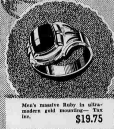
Men's massive Ruby in ultra-modern gold mounting—Tax inc. $19.75