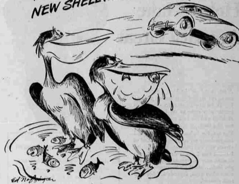
Copyright 1946 Shell Oil Company, Incorporated

WISH WE COULD GET AS FAR ON ONE FILLING AS A CAR WITH A TANKFULL OF NEW SHELL PREMIUM!