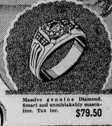
Massive genuine Diamond. Smart and unmistakably masculine. Tax inc. $79.50