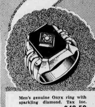
Men's genuine Onyx ring with sparkling diamond. Tax inc. $49.50