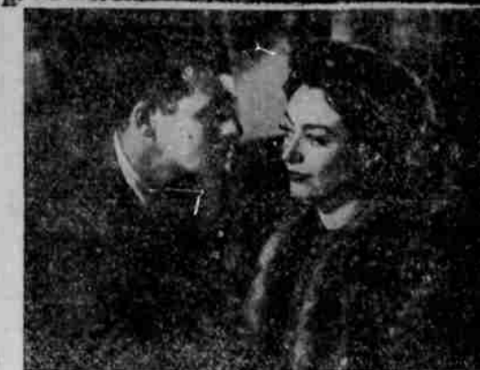
Joan Crawford conversing with Jack Carson to throat a murder in "Mildred Pierce," with Zachary Scott and Eve Arden.