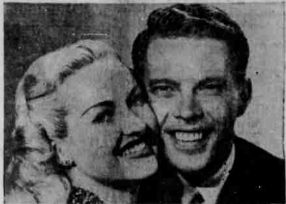
Berry Grable is starred in Twentieth Century-Fox's lavish musical filmed in technicolor, "Billy Rose's Diamond Horseshoe"