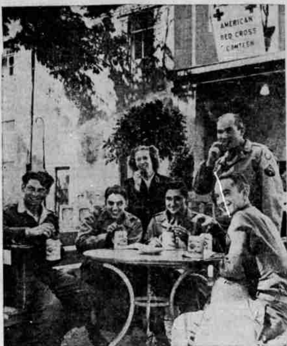
GI'S GET HITLER'S BEER HALL—Beer mugs that once were used by the Nazis to toast Hitler, now hold coffee for doughnut-dunking purposes, as pictured above. Munich beer hall that was the site of Der Fuehrer's 1923 putsch has been taken over by the Red Cross as a canteen for enlisted men and officers.