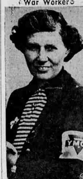
The wartime photo of Mrs. Clement R. Attlee, wife of Great Britain's new Prime Minister, shows her while working at a YMCA club for British troops.