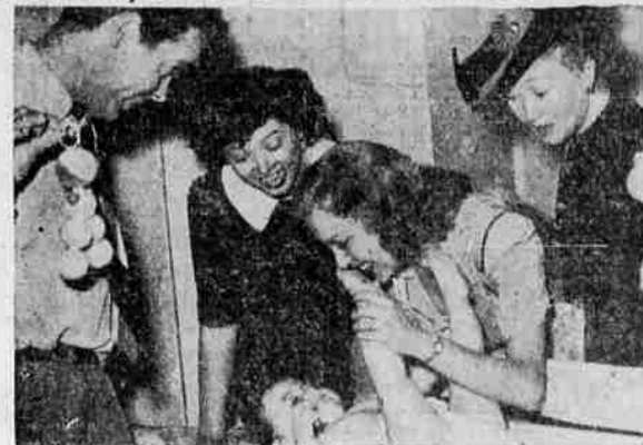
A laugh riot that will set you gasping, with Marjorie Reynolds, Fay Bainter and Charles Ruggles in "Three is a Family," United Artists release.