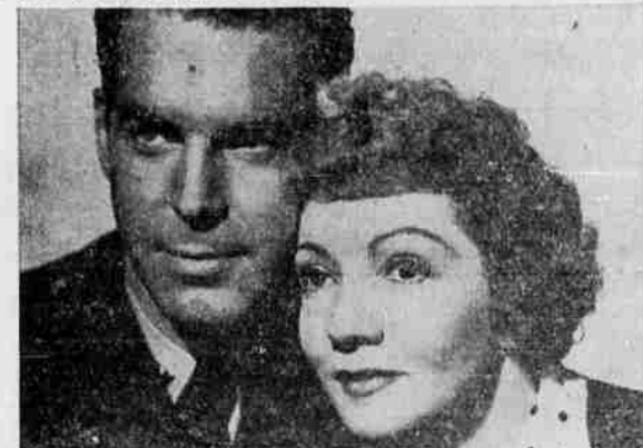
Fred MacMurray and Claudette Colbert are co-starred in the new romantic comedy, "Practically Yours," with Gil Lamb and Cecil Kellaway.