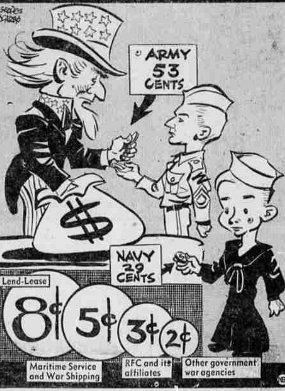
Pie-chart above shows the approximate breakdown, according to participating agencies, of the nation's expenditures from July, 1940, through March, 1945.