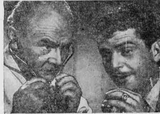
Charlie Ruggles listens to John Carroll's heart beat after an interview with a lady doctor, in this scene from "Bedside Manner," with Ruth Hussey.