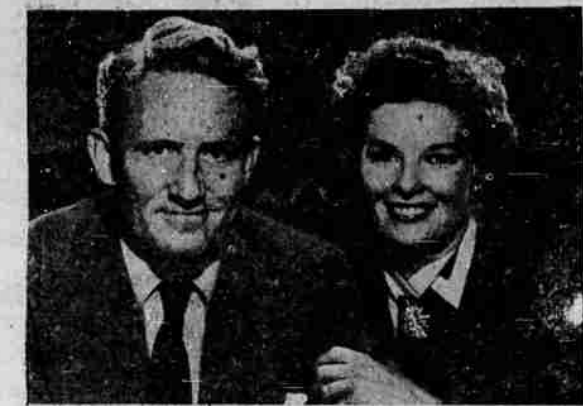
The hit stars of the year in the hit picture of the year, Spencer Tracy and Katharine Hepburn in M-G-M's "Without Love," with Lucille Ball.