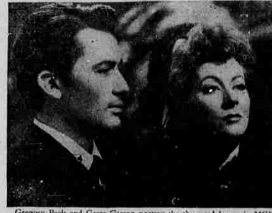
Gregory Peck and Greer Garson portray the thwarted lovers in MGM's production of the best seller, "The Valley of Decision."