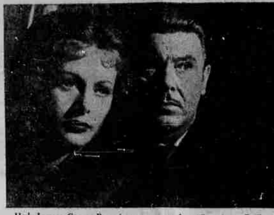
Hedy Lamarr, George Brent in a tense scene from "Experiment Perilous," co-starring Paul Lukas, with Albert Dekker and Olive Blakeney