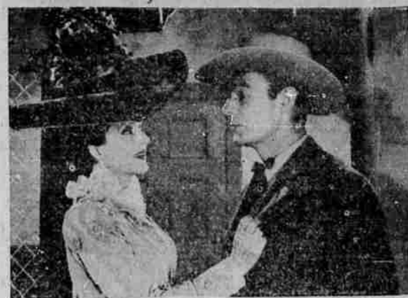
Gypsy Rose Lee and Randolph Scott in a scene from "Belle of the Yukon," a musical extravaganza, with Dinah Shore and Bob Burns.