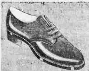
BROWN PLAIN TOE OXFORD 3.98

Has a streamlined look that goes well with your sports suits. The smooth leather takes a high polish.