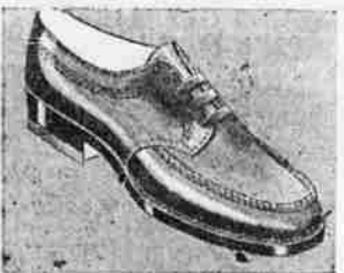
MOCCASIN STYLE OXFORD 5.95

You'll enjoy the sturdy durability of his good looking shoe with heavy, stitched moccasin seam over vamp.