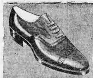
BROWN CUSTOM OXFORD 4.29

You can walk miles with ease in this comfortably fitting LaSalle shoe with arch supporting features.